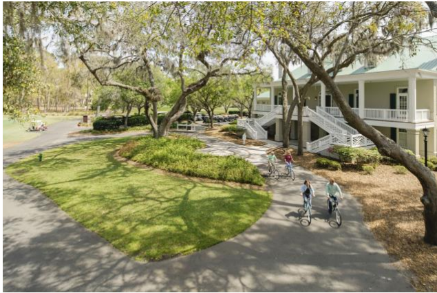
Haig Point Clubhouse

The scientific meeting, welcome reception, breakfast, and formal dinner will take place at the Haig Point Clubhouse. You will have a map in your cart or on the SPUS website to help you get there. Also, google maps or Waze works on Haig Point Plantation.